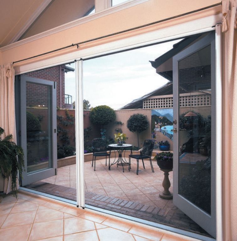
■ Freedom™ Elite is the perfect solution for smaller openings.