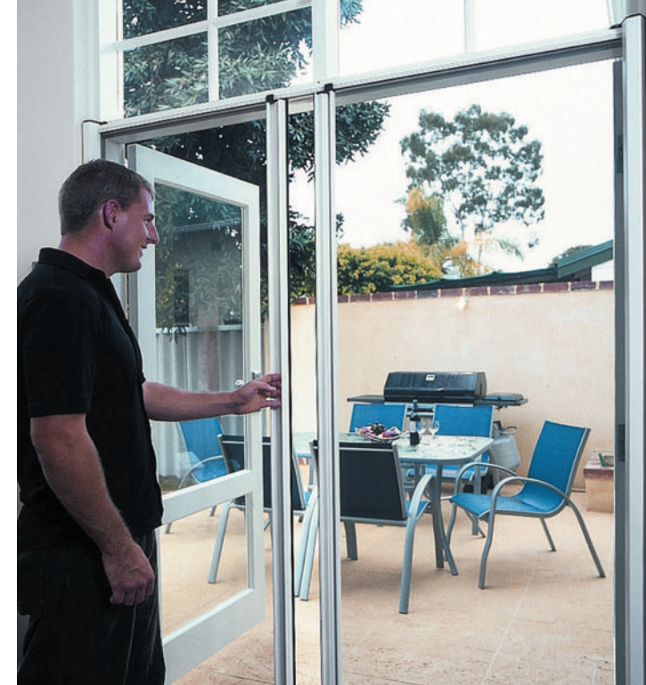
■ Easy-to-use tilt action patented Freedom™ Brake System.